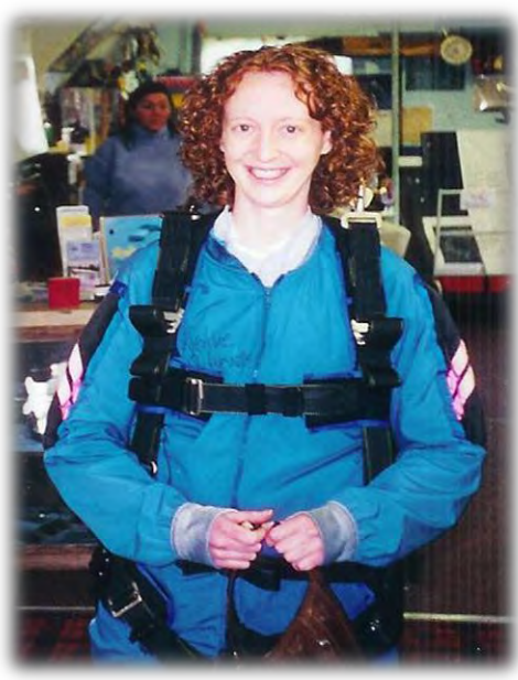
Getting ready to go skydiving - I won't be doing that again!