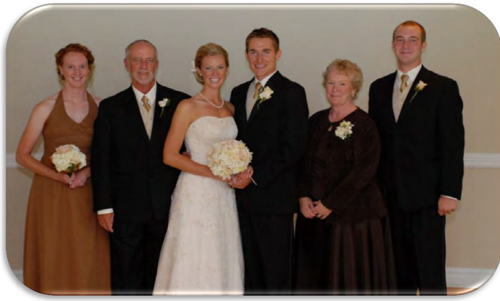
Me, my dad, sister, brother-in-law, mom, and brother at my sister's wedding.