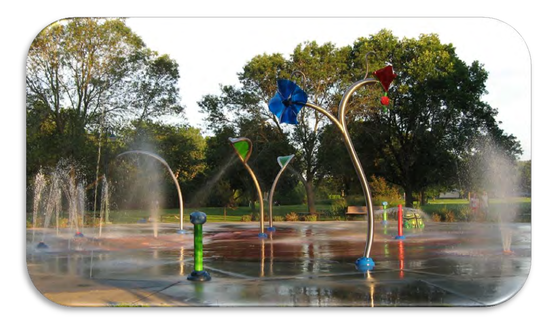
There's a public library a few blocks away, and a brand new "splash park".