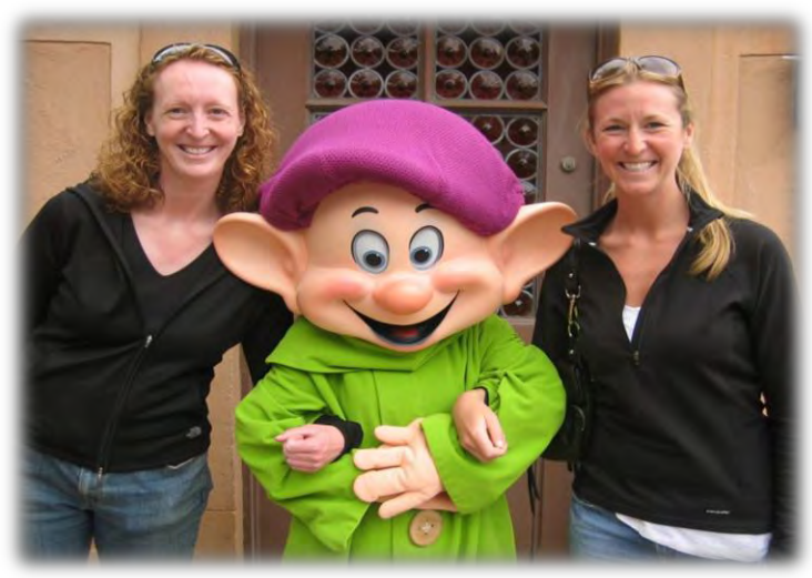
Me, Dopey, and my sister at Disney.