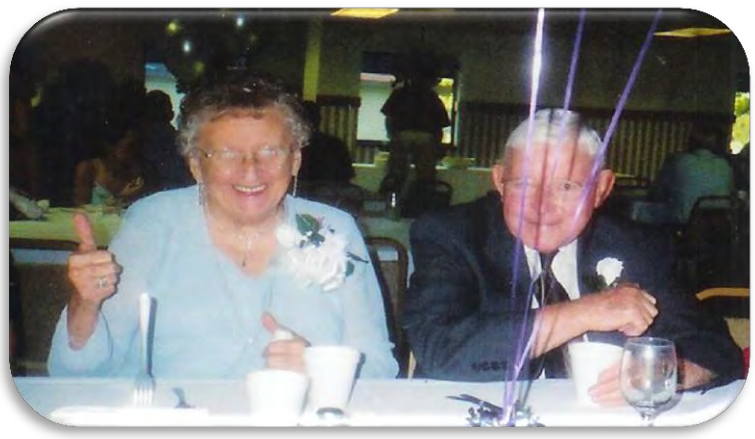
My grandma showing off her fork.