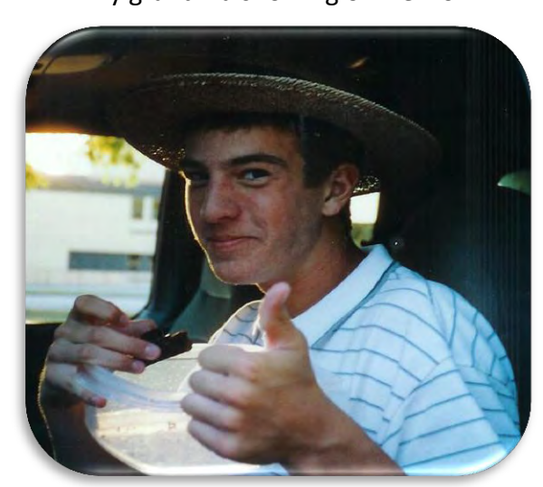
Another thumb's up - this one from my brother who's having a healthy breakfast of brownies on the first day of school.