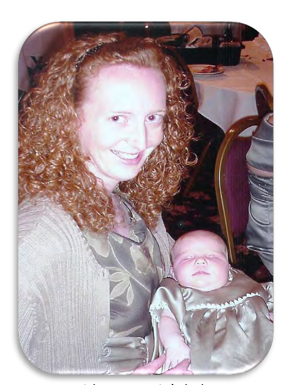
Me with my cousin's baby.