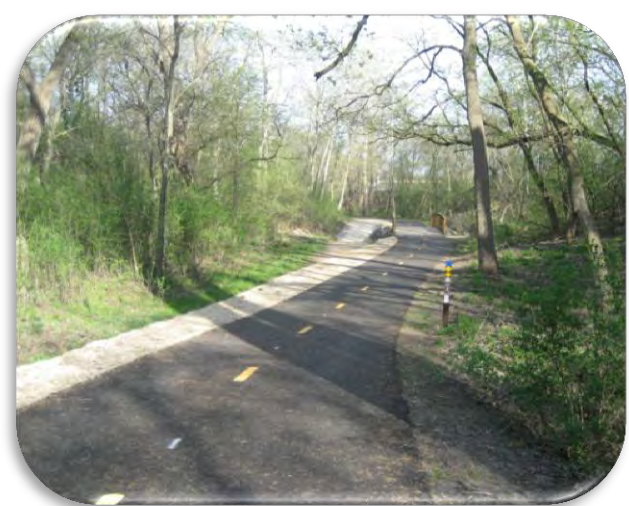
Nature trails with bike and walking paths are also very close, and there's a zoo about 10 miles away.