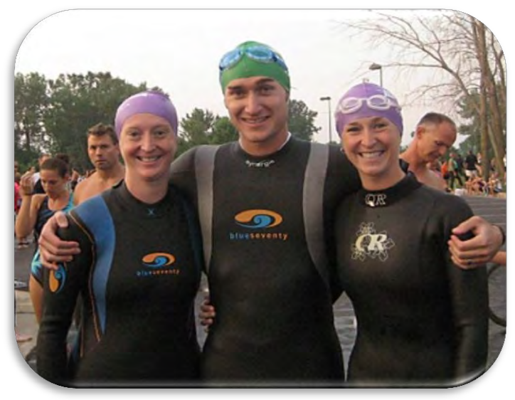
Me, my brother-in-law, and my sister before a triathlon.