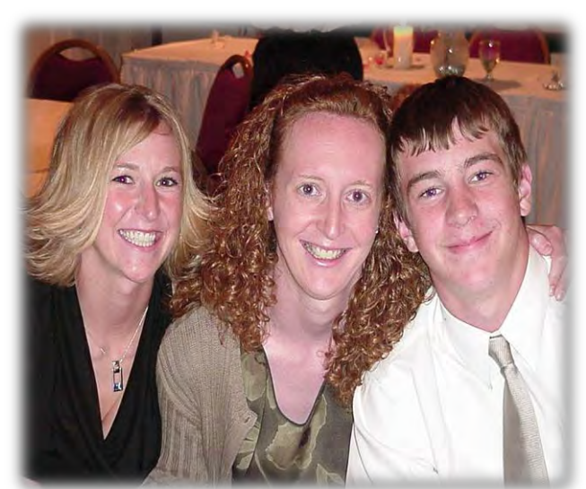
My sister, me, and my brother at a wedding.