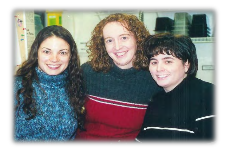
Having fun with a couple friends......