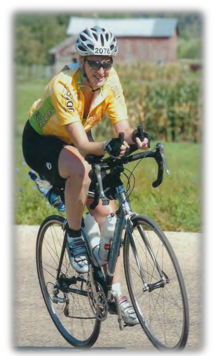
Mile 80 of 140 on Ironman day.