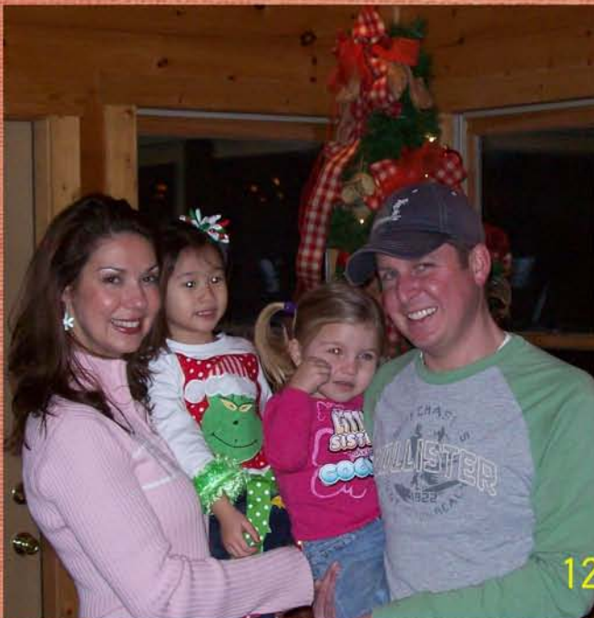
Visiting with cousins and nieces at family get-togethers