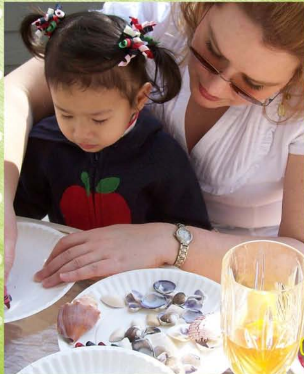
Doing crafts with our god daughter