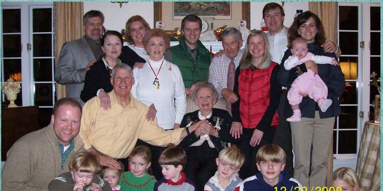
(Part of) Our big family