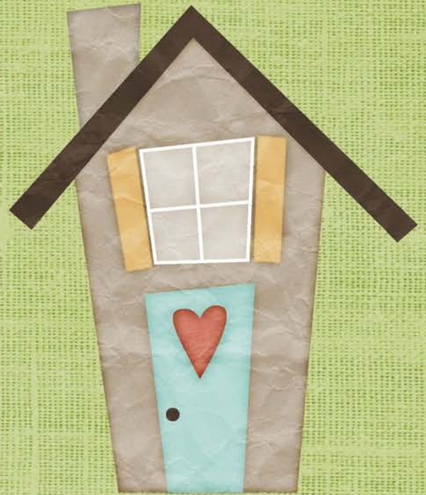
Our garden house - soon to be the perfect playhouse!