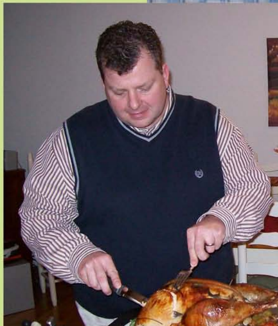
Carving a turkey for a family Thanksgiving dinner