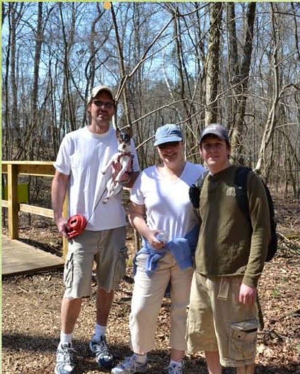
Hiking with friends