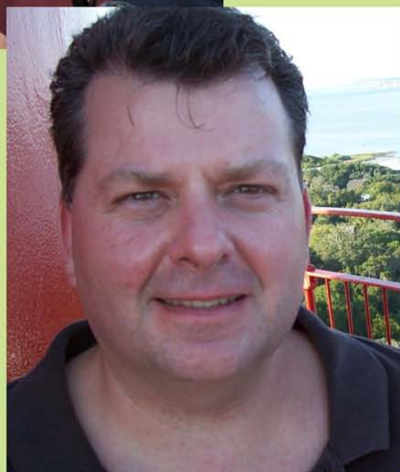
At the top of the lighthouse - family vacation