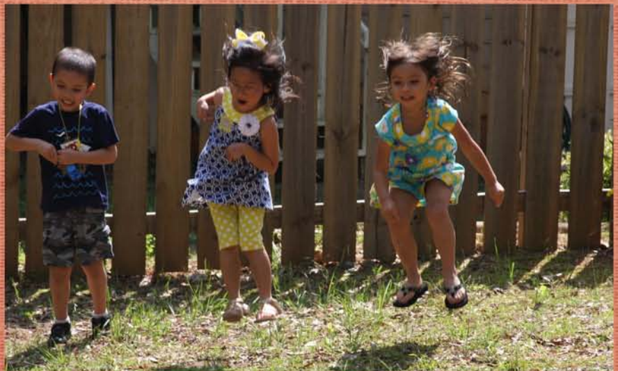
Fun at Family Easter Egg Hunt and Bunny Hop Race