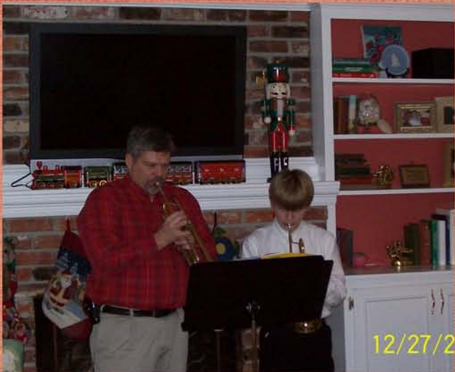
We love music