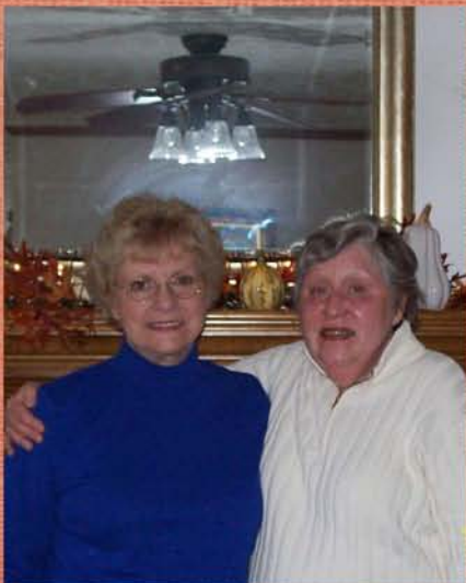
Our mothers spending time together