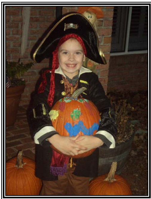
Trick or Treat