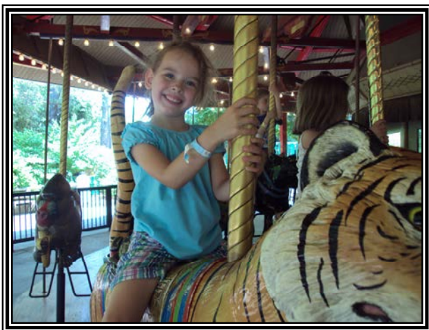
A carousel ride at the zoo