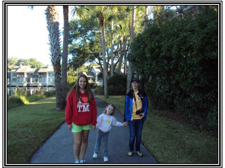
The girls taking a walk