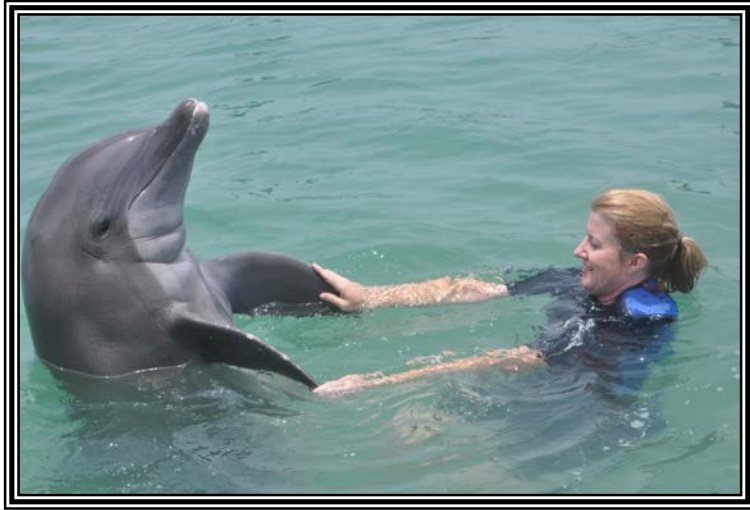
Swimming with dolphins