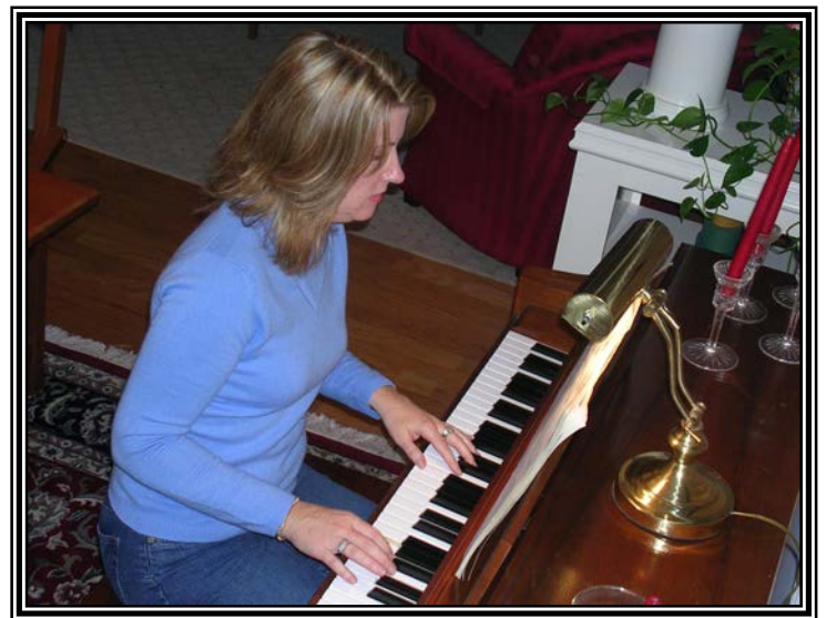
Playing the piano