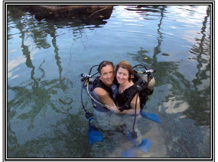
Learning to scuba dive