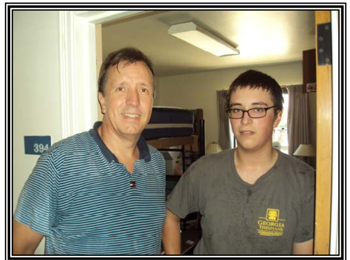
First day of college