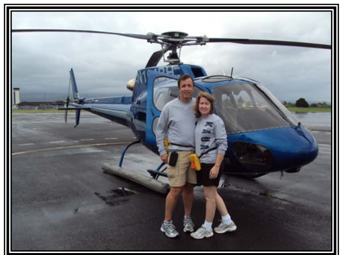
Our 1 st helicopter ride