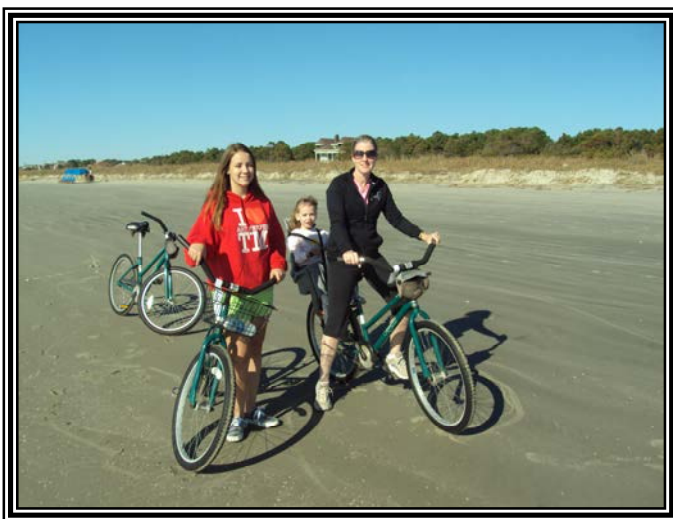
Bike riding at the beach