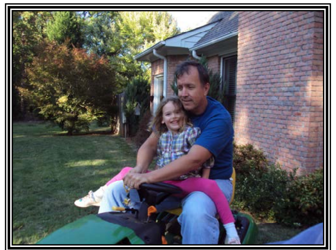
Mowing the yard with Dad